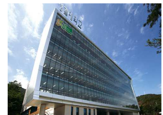
<Academic Information Center>