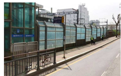
<Myeonghak Station Bus Stop>

- Afternoon: 13:50, 14:10, 16:40, 17:00, 17:20, 17:40