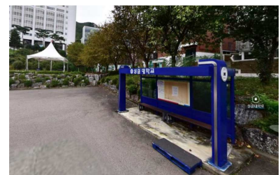
<Sungkyul Univ. Bus Stop>