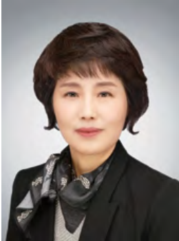
SungKyul University Acting President